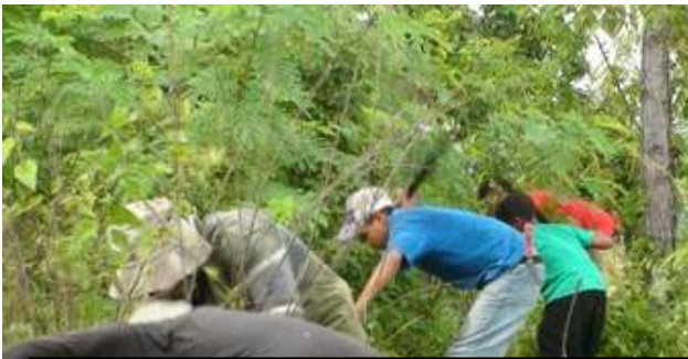
Above: Seven of us, armed only with machetes cleared about four acres in two mornings. Wow!

"True education is the preparation of the mental, moral, and physical powers for the performance of every duty, pleasant or otherwise, the training of every habit and practice, of heart, mind, and soul for divine service. Then of you it can be said in the heavenly courts, 'Ye are laborers together with God'" (see 1 Cor. 3:9) (3 Selected Messages, p. 228).