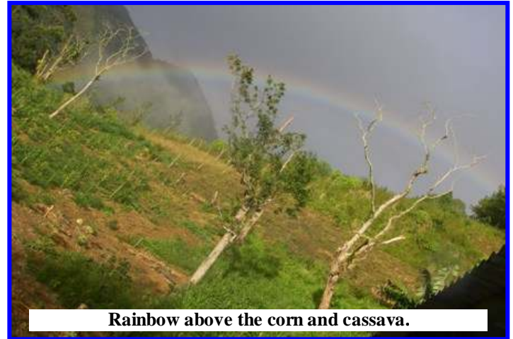
Rainbow above the corn and cassava.