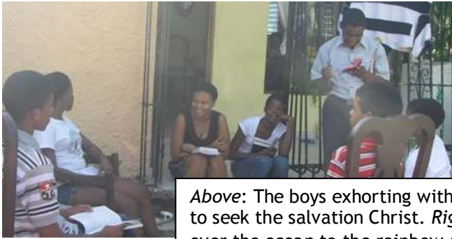
Above: The boys exhorting with love other youth to seek the salvation Christ. Right: Looking out over the ocean to the rainbow on the horizon.

In two mornings, starting immediately after 6:00 am worship and ending at twelve, we hand cleared four acres of heavy brush! Everyone that saw the work was very impressed, including the neighbors who we'd be visiting in the afternoons. The boys went beyond what we anticipated in giving literature and actually engaged and challenged some of the