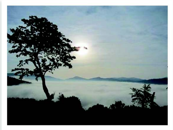
Left: Young people laying the first line of block on the freshly poured foundation. Middle: Elizabeth tries to work with the wheel barrel for a moment. Right: The breathtaking view of the cloud filled valley below Beautiful River at 6:15 am.